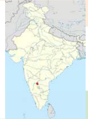
Bellary is in the Hyderabad-Karnataka, Deccan region.

Languages : Kannada, Telugu, Urdu, and English.