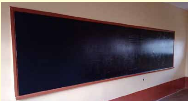
Above: The old blackboards. Below and right: The new renovated blackboards.