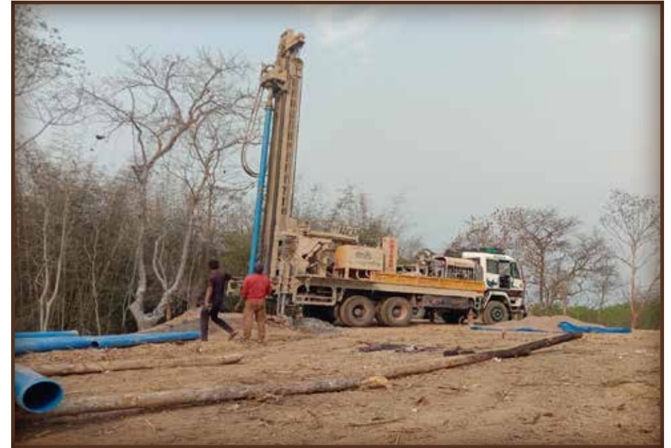
Foundations of Friary commence : Borewell Digging.

The beginning of every mission is difficult and its adventurous. We can't take anything for certain. A lot of exploration and new learning has happened with regard to this mission. But we are sure that after five to ten years, our Franciscan presence is going to make a lot of difference to us and to the people whom friars are going to serve.