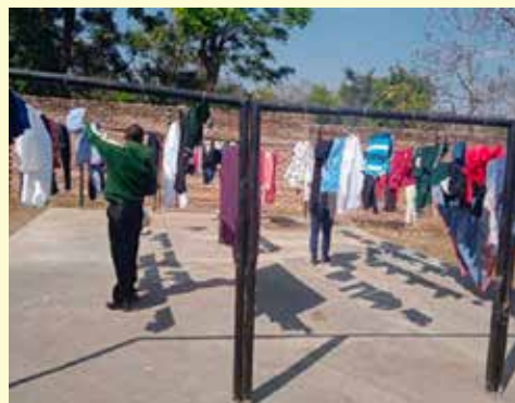
The whole drying process is now more hygienic and practical.