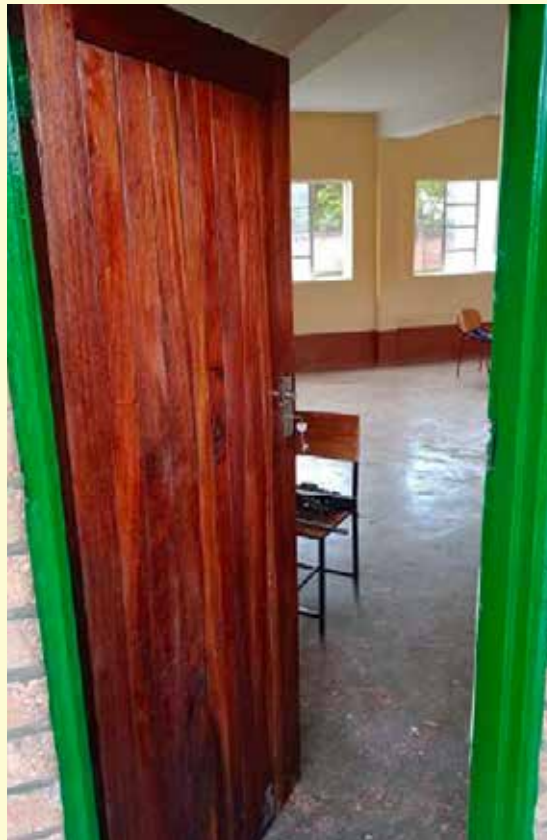
The classrooms are now much more appealing and positive places in which to learn.