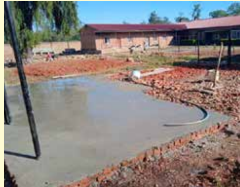
The concrete being laid prior to the final lines being erected.