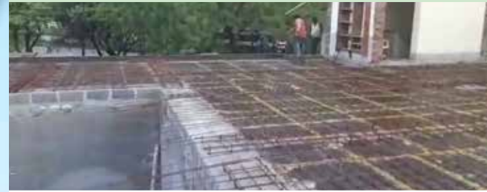
Roofing reinforcement work begins.