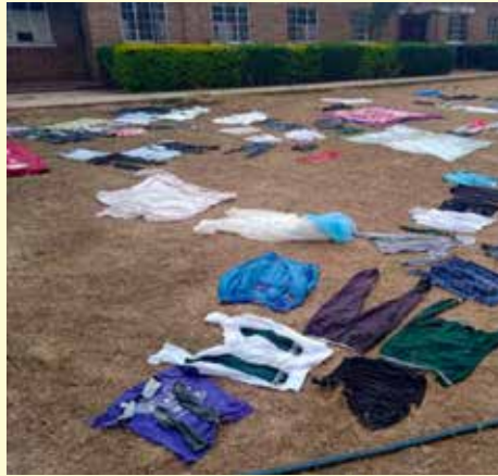
Seminarians used to dry clothes on the ground before the construction of the drying lines.

As well as the extensive refurbishment of the interior and exterior of the buildings two new clothes drying sites were installed.