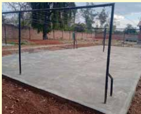
The poles are up and the clothes lines are in place ready for use.