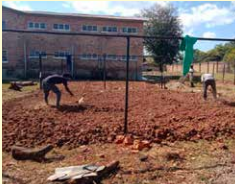
Work in progress - Levelling of the site in preparation for concrete slabbing.