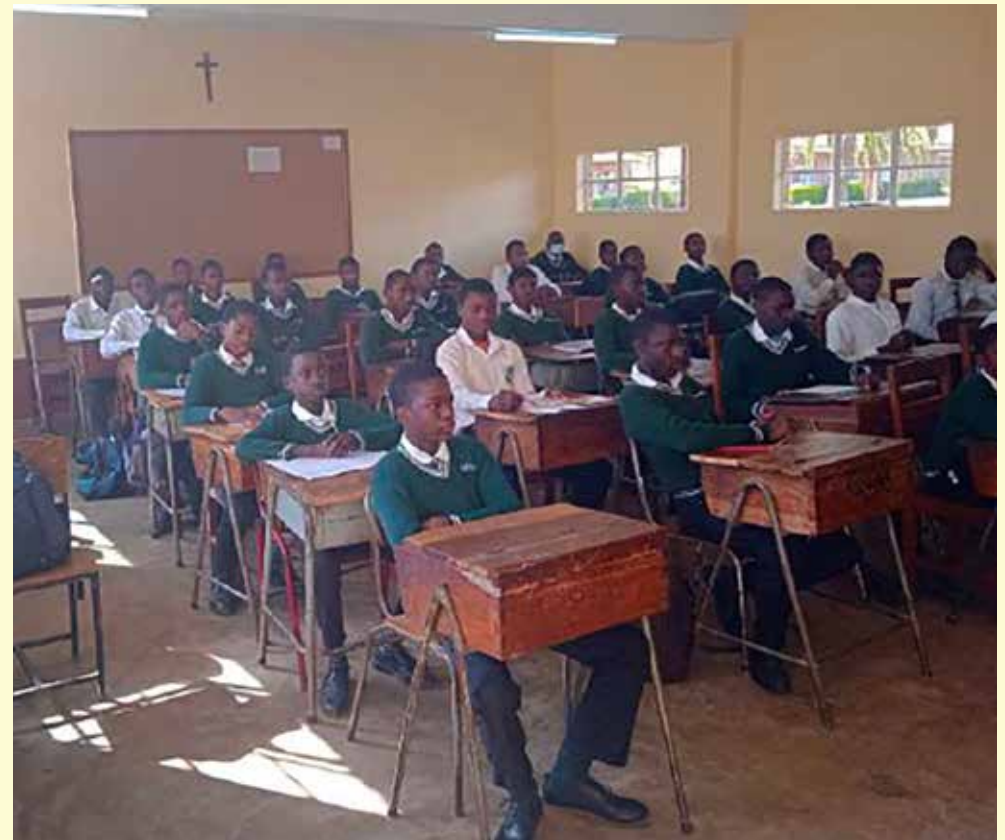
Students will certainly reap the rewards from their new environments.