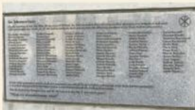
Above: The plaque on the East wall of the Garden.

The message written says that those who built the garden saw it as a gesture of peace and reconciliation and as a contribution to the Healing of Memories.