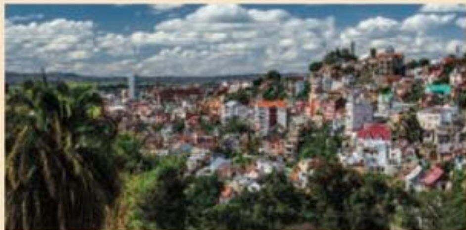
Antananarivo, also known by its colonial shorthand form Tana, is the capital and largest city of Madagascar.

they have begun a project of self-sustainability and it is for this project that the Friars are asking help.