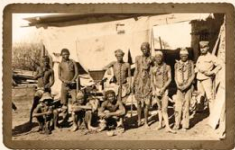
Chained prisoners from the Herero and Nama tribes during the 1904-1908 war against Germany, in which many atrocities took place.