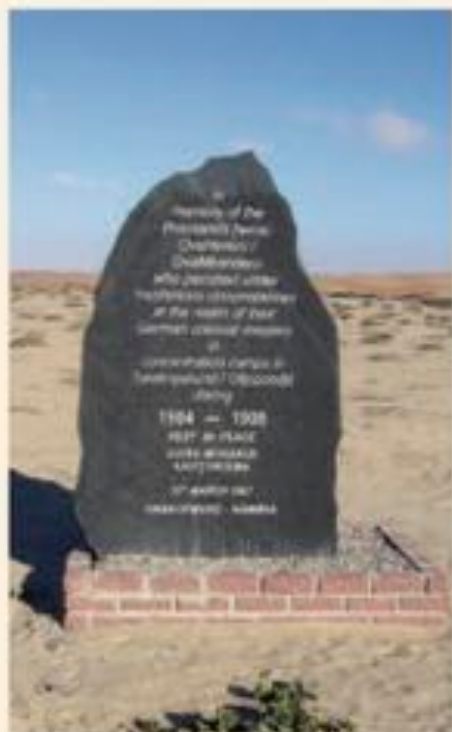
The memorial stone erected in the Swakopmund cemetery in 2007.

As I write these few words I say thank you very much to the readers of the Troubadour and to all who work for and support the Franciscan Missionary Union in the custody of Great Britain. Your support has allowed us to encourage and help the people who live in Namibia to take some small steps on the road to