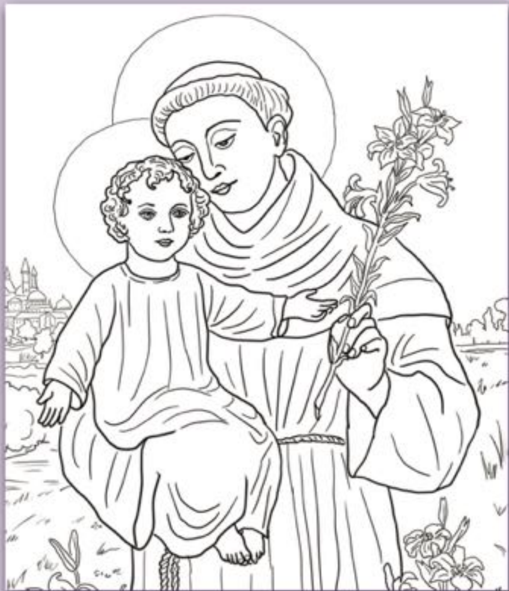
St. Anthony of Padua, patron saint of lost and stolen articles

Colour this page as neatly and brightly as you can. HAVE FUN!