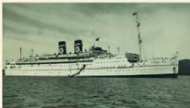
Below: The ill fated Arandora Star, on which so many souls lost their life

This statement struck me immediately as I have come to